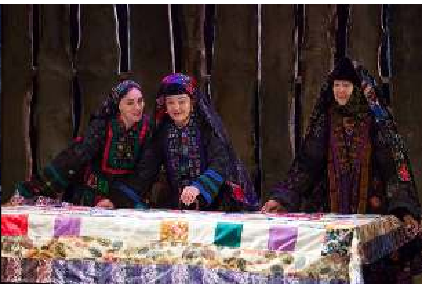
OPERA FESTIVAL NAMED AFTER F.I. SHALYAPIN