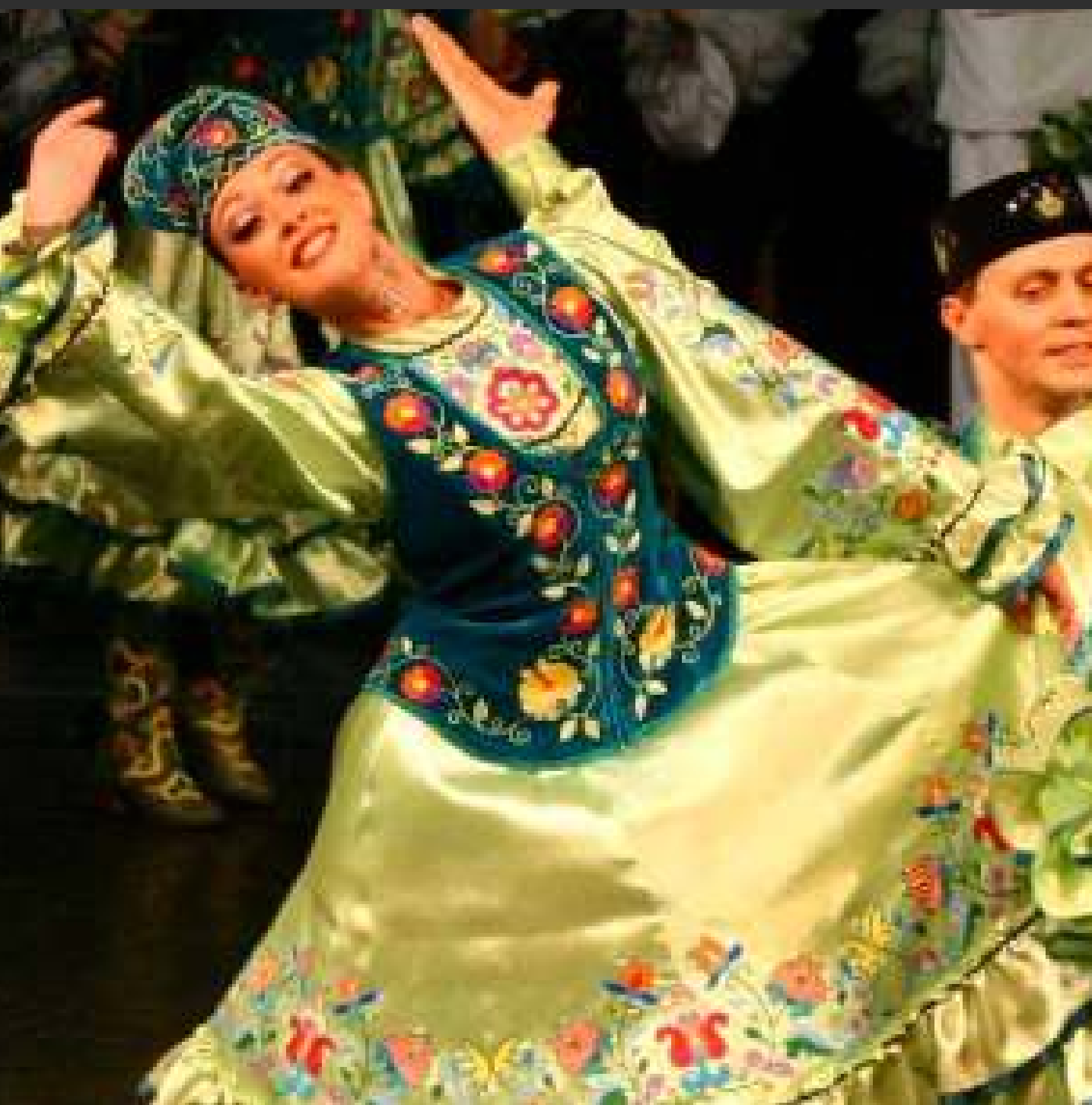
TATAR NATIONAL ORNAMENT